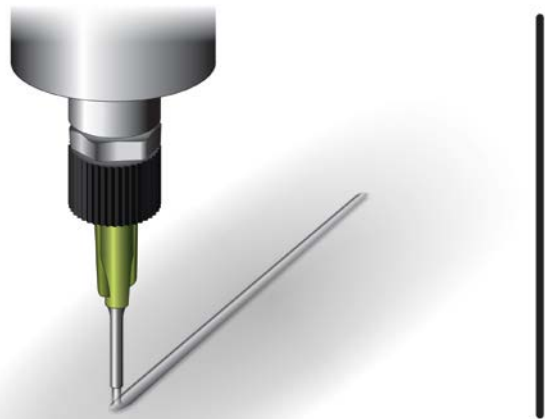
Figure 2. Needle applicator. Tip and coating pattern (left), top view of final pattern (right).

Needle applicators have a wider viscosity range than film coaters and can be used for complementary applications. Needle dispensing uses fluid reservoir pressure to push the material through a needle to form a narrow bead, working on time/pressure technology. The needle's uniform, narrower pattern shape enables contouring patterns, like circles or sharp 90-degree angles. Using a continuous path program routine can seamlessly smooth contour lines into a clean perimeter dispense. See Figure 2.