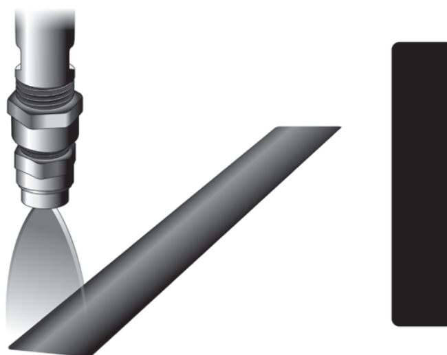
Figure 1. Film or Curtain Coater.

A film coater dispenses in two distinct shapes. The primary shape is a leaf pattern that is made with a cross-cut nozzle to establish a fan-shape pattern that dispenses a curtain of material as the applicator moves. At the perpendicular angle, the dispense pattern is a knife edge that sets the pass edge on the substrate. Dispense pass width can range from 3-15mm, though typical dispense passes are ~10-12mm wide. The shape enables the placement of significant quantities of fluid in broad, wide passes that are ideal for low-profile, surface mount populated boards. With low components, the applicator can sweep across the board at speeds up to 750mm/sec. Figure 1 illustrates the pattern and dispense shape.