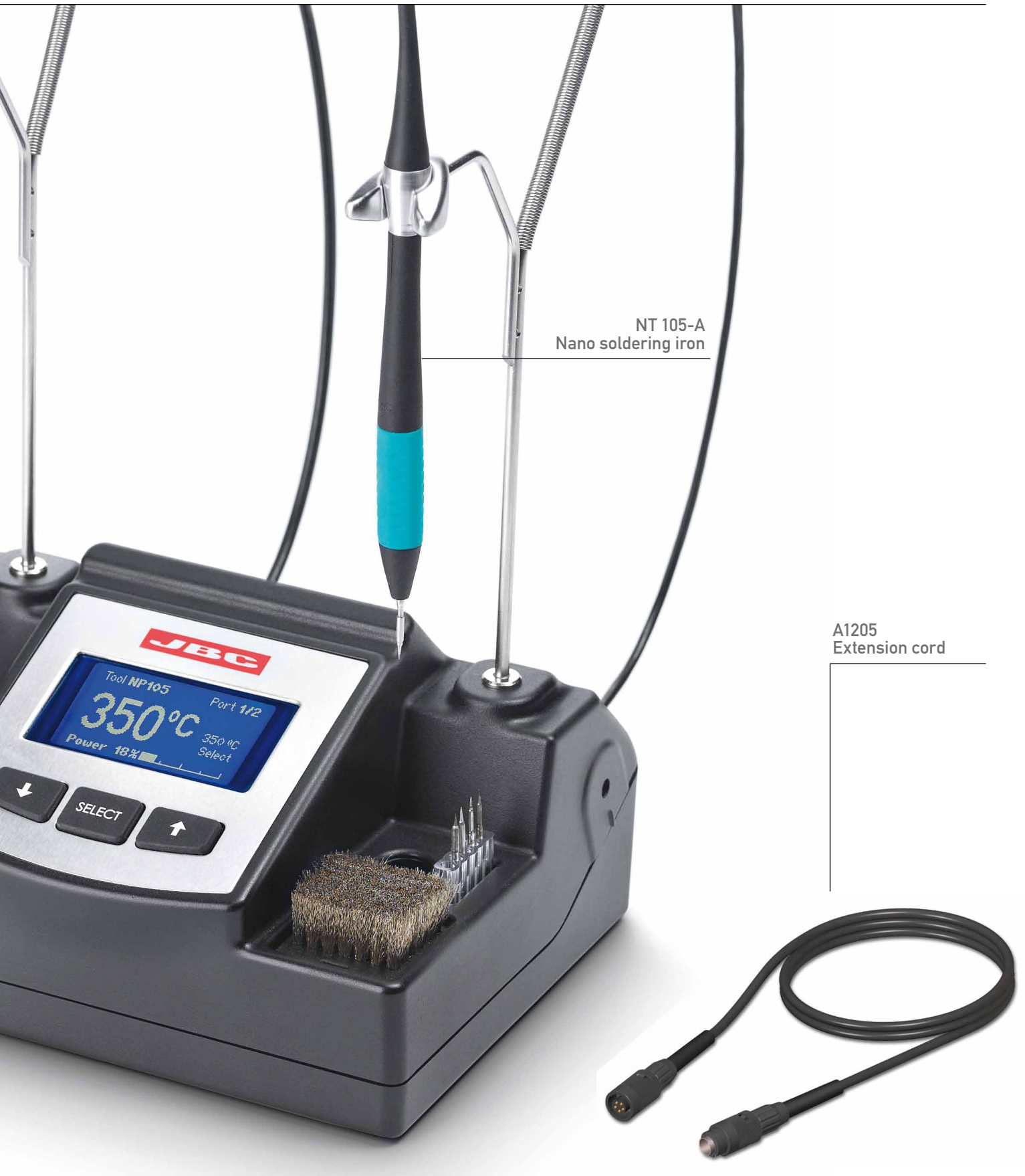
NT 105-A Nano soldering iron