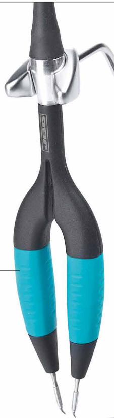
NP 105-A Nano tweezers

Set: C105-101 C105-103 C105-105 C105-108 C105-111